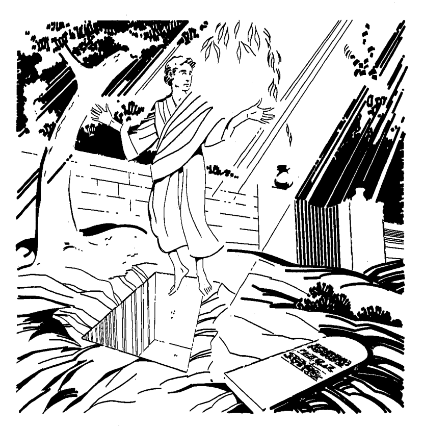
"The dead in Christ shall rise first---." I Thess. 4:16