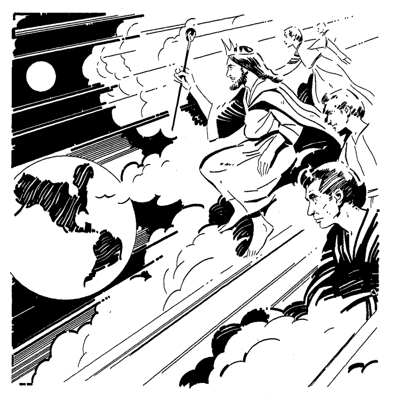
The Lord Jesus shall be revealed from heaven with His mighty angels, in flaming fire taking vengeance——" II Thess. 1:7, 8